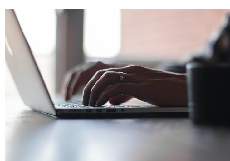
ELECTRONIC AND ELECTRIC DEVICES